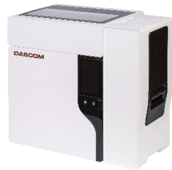
Double Card model